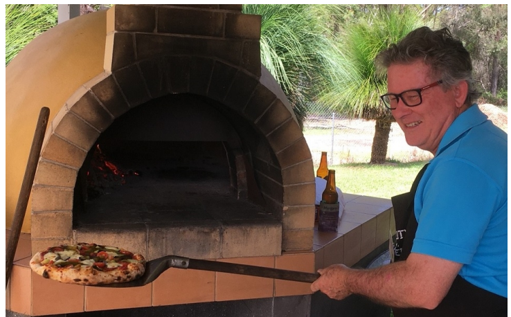
Plenty of good food and good company, plus the usual UNO session. A fun afternoon to finish off the week.